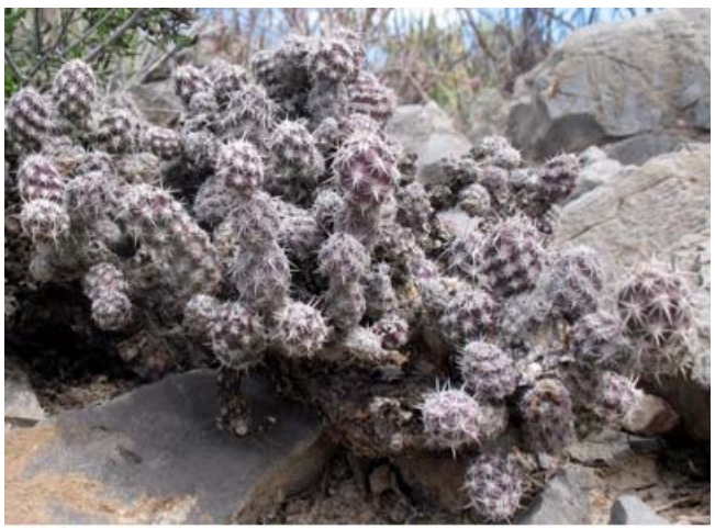
Opuntia (Corynopuntia) bulbispina

"Camp Comanche," one of the 14 engravings in Commerce of the Prairies, depicts Josiah Gregg standing on a knoll with an Indian guide, watching, across a deep plain where prairie wagons are encamped, the approach of a great band of Comanche warriors. He is wearing a plainsman's wide-brimmed hat and a knee-length coat.